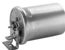
331-4312 Actuator with pivot mounting bracket.