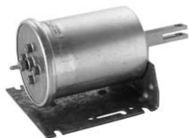
331-4314 Actuator with fixed mounting bracket and clevis.