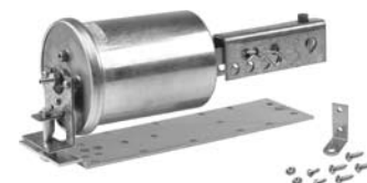
331-4311 Actuator, clevis and rocker arm. Mounting for extended shaft.